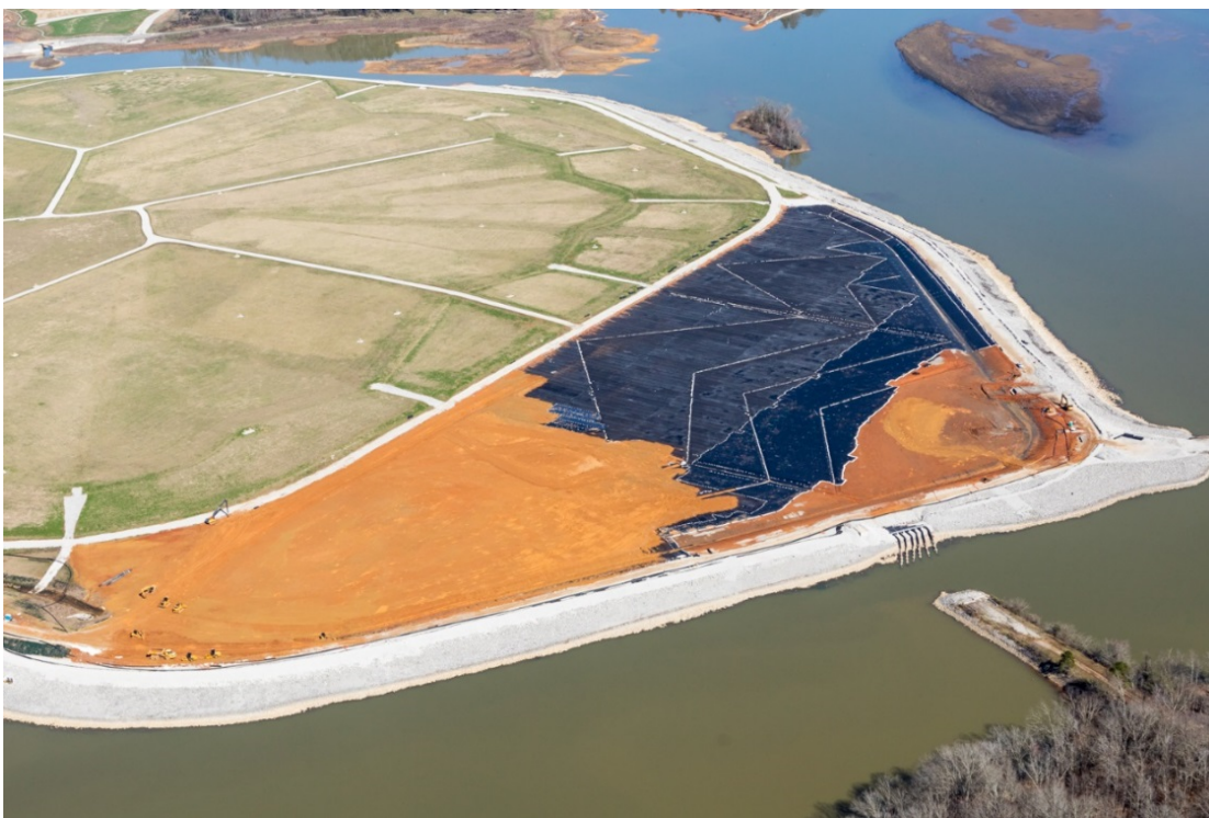
Figure 1 Aerial Photograph of KIF Stilling Pond Closure (February 27, 2018)

The subsections under §257.73(d) set forth criteria for the periodic structural stability assessment of the appurtenances. Sections 2.1 to 2.3 below provide descriptions of the individual unit elements that fall within the appurtenance categories: embankments, spillways, or hydraulic structures. Figure 2 provides an overview of the Stilling Pond.