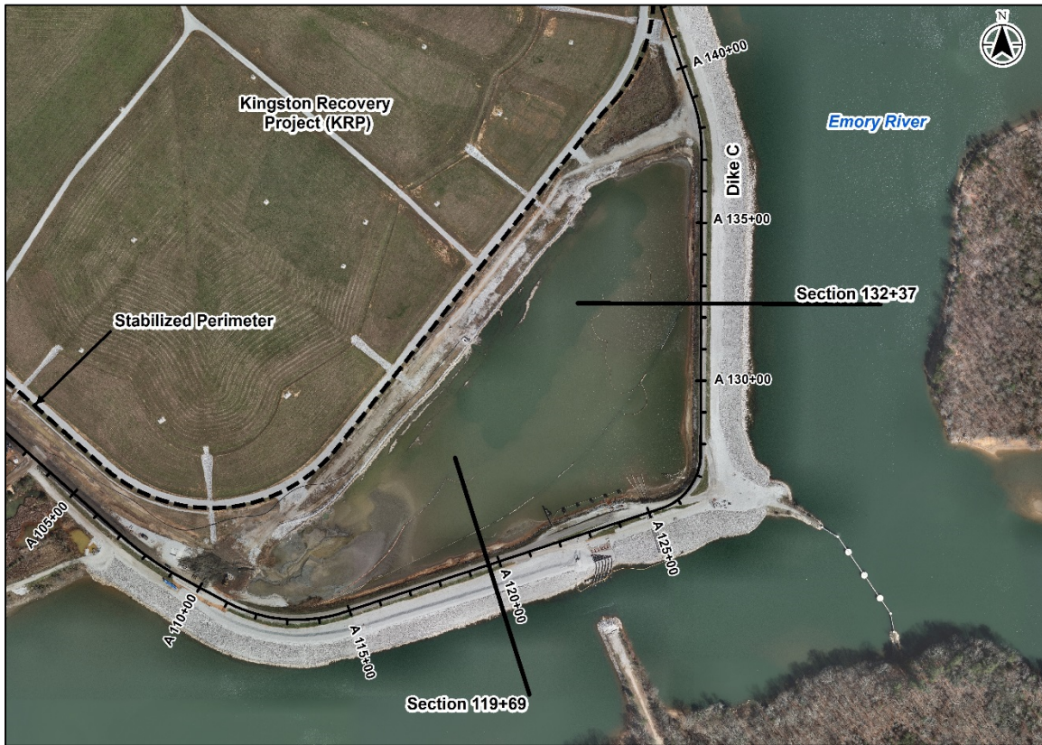
Figure 3 Aerial Photograph of KIF Stilling Pond Prior to Closure

Sudden Drawdown Assessment (§257.73(d)(1)(vii)) April 17, 2018