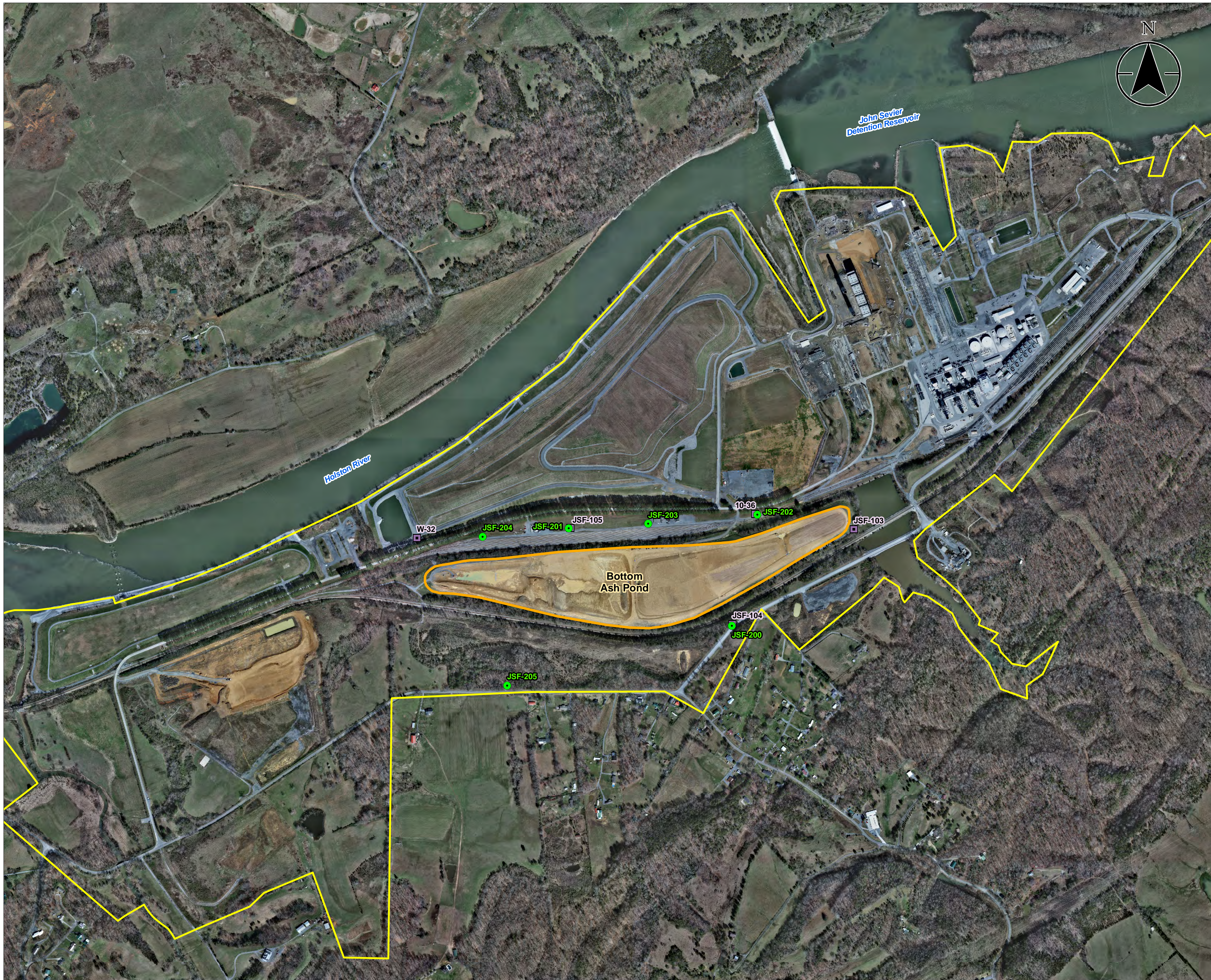
Figure No. 1 Title CCR Rule Monitoring System Plan, Bottom Ash Pond

Client/Project Tennessee Valley Authority John Sevier Fossil Plant