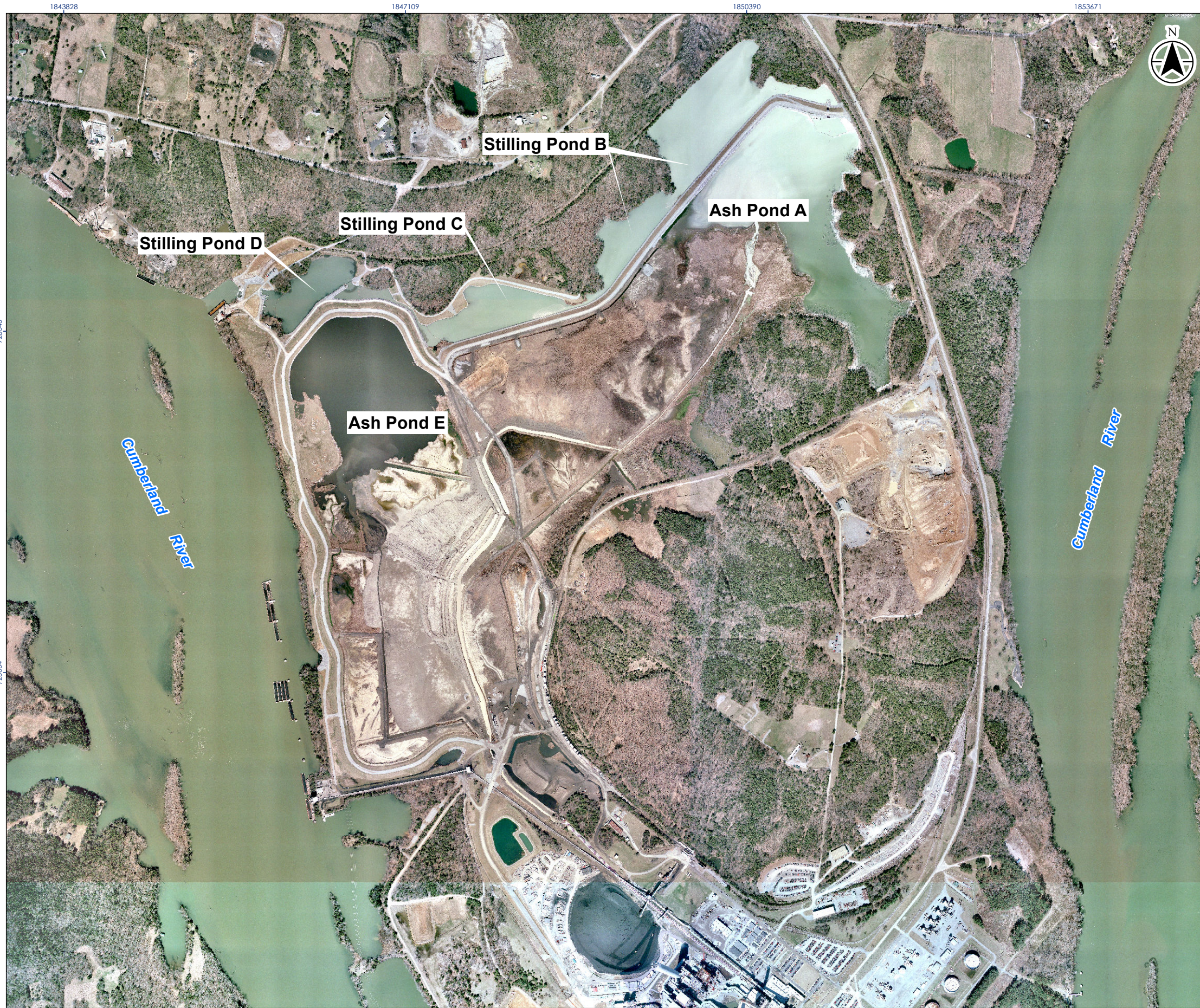
Figure No. 1 Title Site Overview GAF - Ash Pond A Client/Project Tennessee Valley Authority Gallatin Fossil Plant (GAF) Hazard Potential Classification Assessment Project Location: Gallatin, TN Prepared by: BSJ on 2015-06-29 Technical Review by: MMM on 2016-09-30 Independent Review by: MMM on 2016-09-30