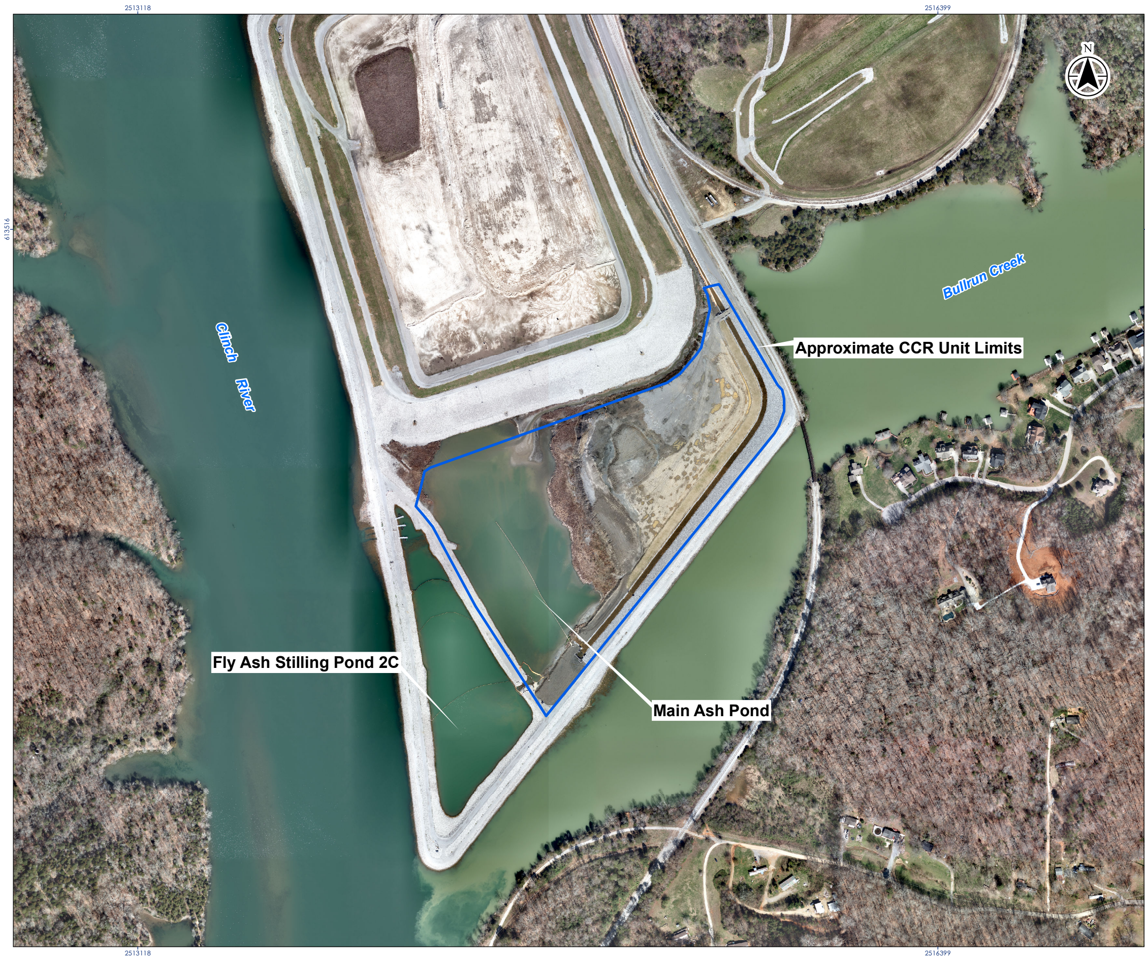
Figure No. 1 Title Site Overview - BRF - Main Ash Pond Client/Project Tennessee Valley Authority Bull Run Fossil Plant (BRF) Hazard Potential Classification Assessment Project Location: Clinton, TN Prepared by mmm on 2018-04-12 Technical Review by awg on 2018-04-12 Independent Review by wrm on 2018-04-12 175565009